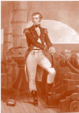
Commodore Stephen Decatur, USN, (1779-1820)