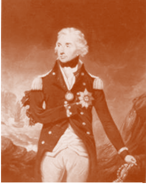
Lord Horatio Nelson (1758 - 1805)

Phila. Assoc. for Critical Thinking 639 W. Ellet Street Philadelphia, PA 19119